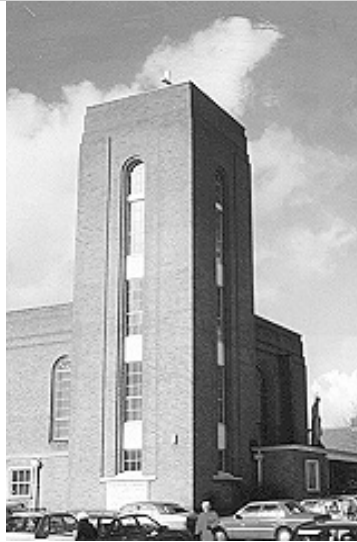
OUR LADY, QUEEN OF APOSTLES